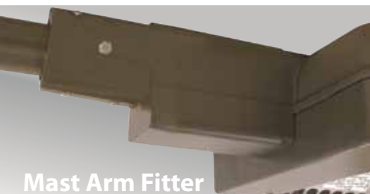
Mast Arm Fitter